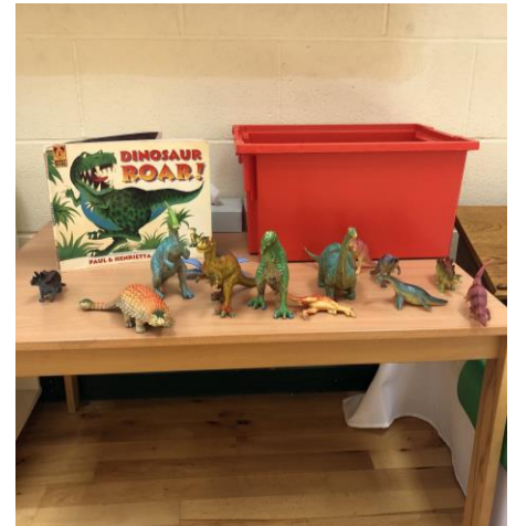
Class 1 & 2 used model dinosaurs to help create their own movements in dance.